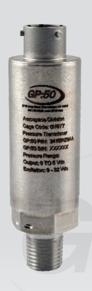
Model 241 / 341 High-Accuracy Pressure Transducer